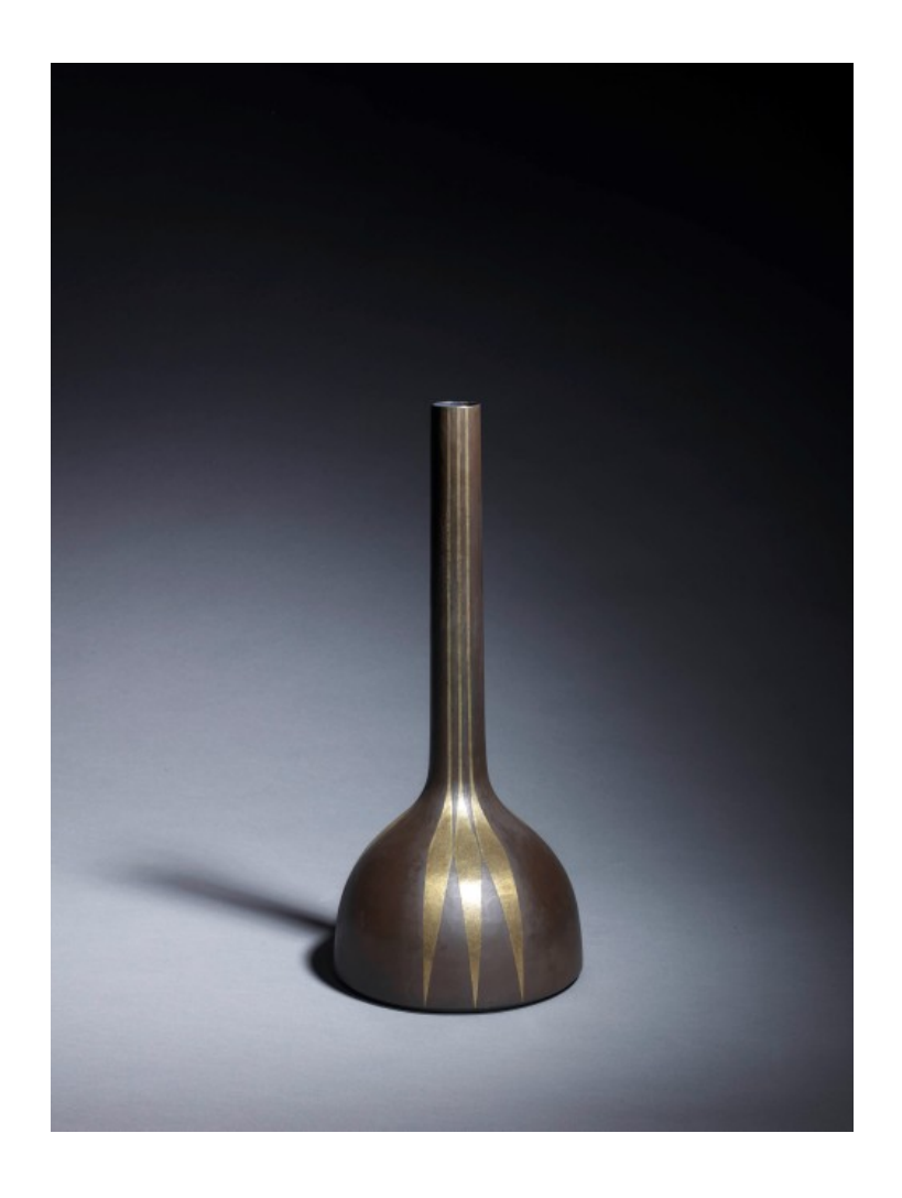
An inlaid iron flower vessel with a stylised bamboo leaves design